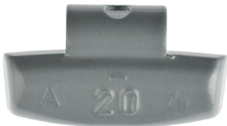
Series 63 - Zinc Coated - For alloy wheels