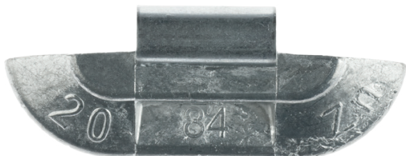
Series 84U - Zinc Uncoated - For steel wheels

With a legacy of delivering new ideas to the industry, we have done it again.