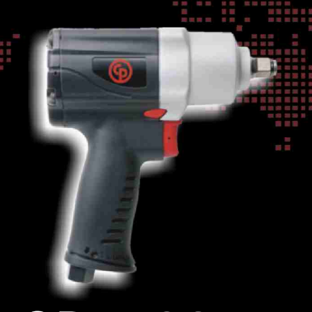
CP7739 1/2" Impact Wrench