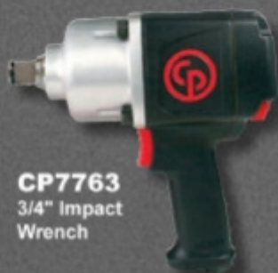
CP7763 3/4" Impact Wrench

PURCHASE A CP7763 3/4" IMPACT WRENCH AND RECEIVE A FREE CP8738 3/8" CORDLESS IMPACT WRENCH