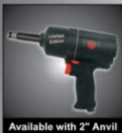
Available with 2" Anvil