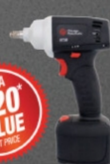
CP8738 3/8" Cordless Impact Wrench

PURCHASE A CP7763 3/4" IMPACT WRENCH AND RECEIVE A FREE CP8738 3/8" CORDLESS IMPACT WRENCH