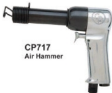
CP717 Air Hammer

PURCHASE A CP717 AIR HAMMER AND RECEIVE A FREE CP7500 2" GRINDER