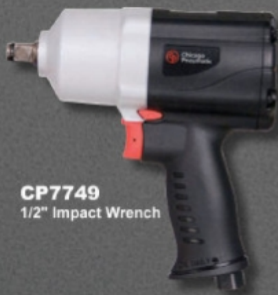
CP7749 1/2" Impact Wrench

PURCHASE A CP7749 1/2" IMPACT WRENCH AND RECEIVE A FREE 13-PIECE SOCKET SET