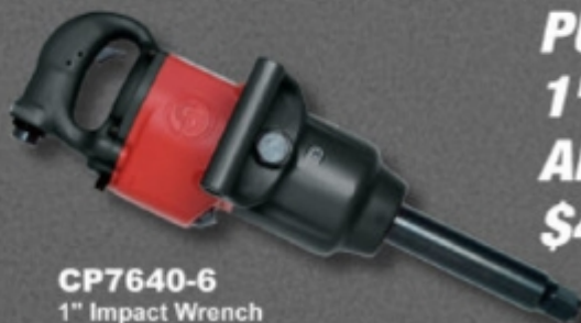
CP7640-6 1" Impact Wrench

PURCHASE A CP7640-6 1" IMPACT WRENCH AND RECEIVE A FREE $40 GIFT CARD