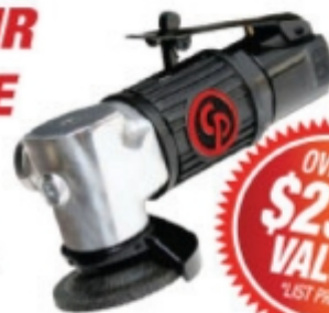
CP7500 2" Grinder

PURCHASE A CP717 AIR HAMMER AND RECEIVE A FREE CP7500 2" GRINDER