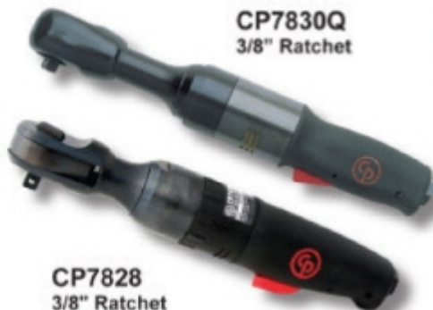
CP7830Q 3/8" Ratchet