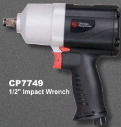
CP7749 1/2" Impact Wrench

PURCHASE A CP7749 1/2" IMPACT WRENCH AND RECEIVE A FREE 13-PIECE SOCKET SET