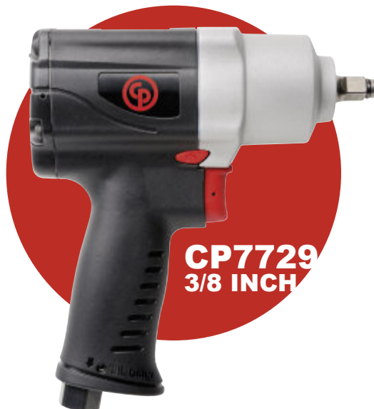
CP7729 3/8 INCH

The CP77X9 family of impact wrenches share more than good looks. Each impact wrench in the CP77X9 line features a twin hammer clutch with magnesium clutch housing to ensure long term durability and power, and a full tease trigger for ultimate control. The tools' three-position regulator in forward provides extra control and helps to prevent over-tightening, while full power remains constant in reverse to ensure technicians have max power to remove fasteners without changing the setting in the forward position.