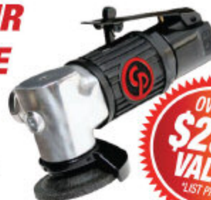
CP7500 2" Grinder

PURCHASE A CP717 AIR HAMMER AND RECEIVE A FREE CP7500 2" GRINDER