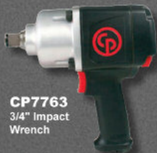
CP7763 3/4" Impact Wrench

PURCHASE A CP7763 3/4" IMPACT WRENCH AND RECEIVE A FREE CP8738 3/8" CORDLESS IMPACT WRENCH