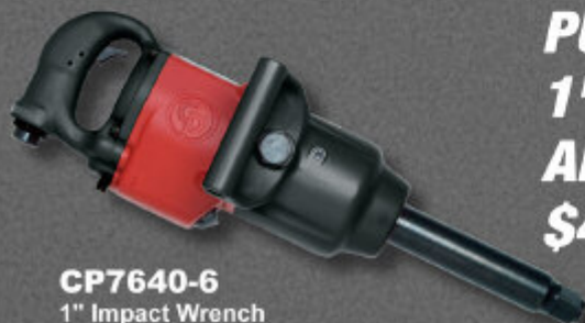
CP7640-6 1" Impact Wrench

PURCHASE A CP7640-6 1" IMPACT WRENCH AND RECEIVE A FREE $40 GIFT CARD