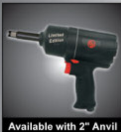
Available with 2" Anvil