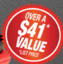
SS4013 1/2" Drive 13 Piece SAE Set