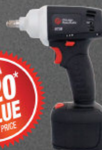
CP8738 3/8" Cordless Impact Wrench

PURCHASE A CP7763 3/4" IMPACT WRENCH AND RECEIVE A FREE CP8738 3/8" CORDLESS IMPACT WRENCH