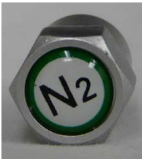
Part Number 690 Grey plastic sealing N 2 cap.