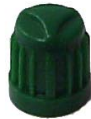
Part Number 897 Green plastic cap for tire valves.