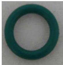
Part Number 885 Green O-Ring for tire valves.