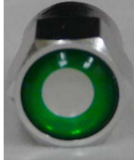
Part Number 680 Polished aluminum sealing cap.