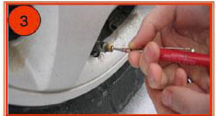
Jack or hoist the vehicle up, then remove valve core, completely deflate tire with valve at bottom of wheel assembly

Note If a tire and wheel is un-balanceable by regular machine balancing most likely CBB or CB isn't the answer