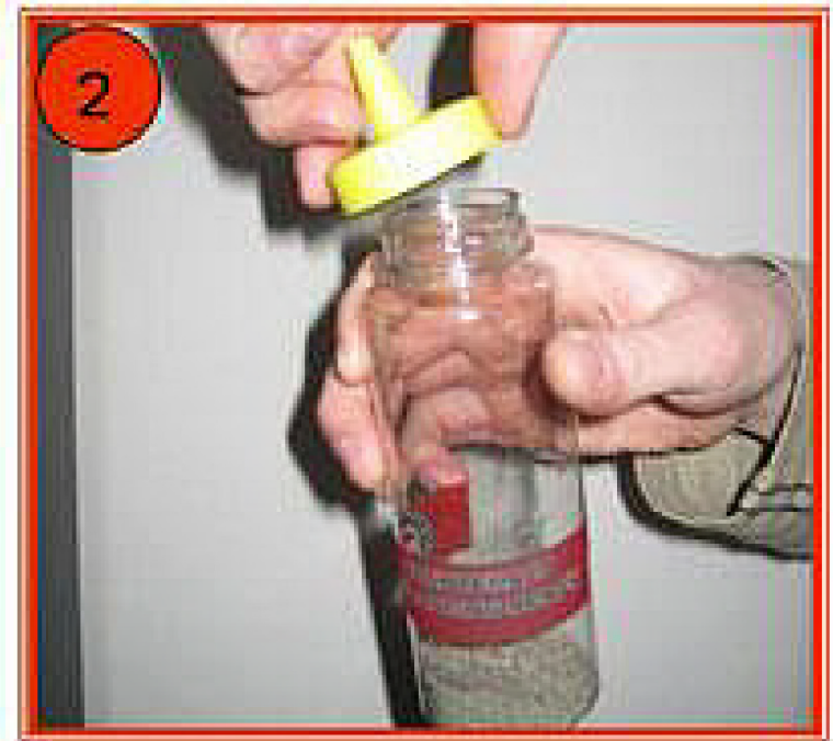
Replace screw on cap

Note If a tire and wheel is un-balanceable by regular machine balancing most likely CBB or CB isn't the answer