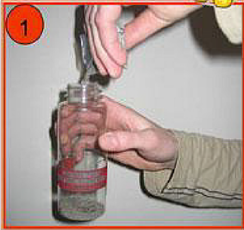
Pour contents of CBB bag into bottle