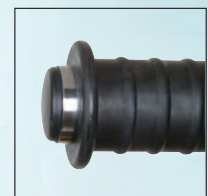
'P' Type - Sealed Adjustment

† Length with adjusting nut set to minimum torque.