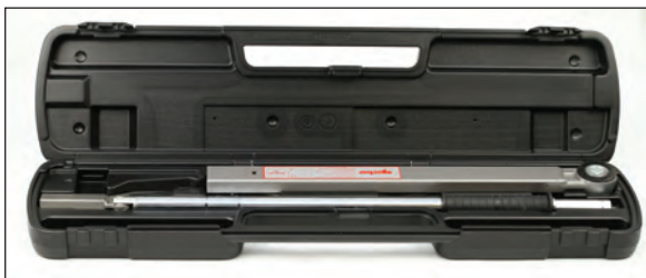
Split Industrial in Box.