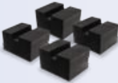
Four 1/8" spotting block auxiliary adapters Part#: 63100

For more information, contact your Authorized Challenger Lifts Distributor: