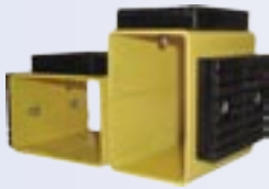
4 two position adapter blocks included Part#: SR10-001