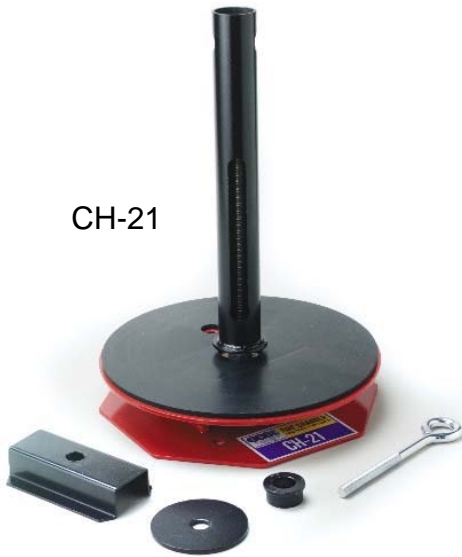
SWATT Tire Changer