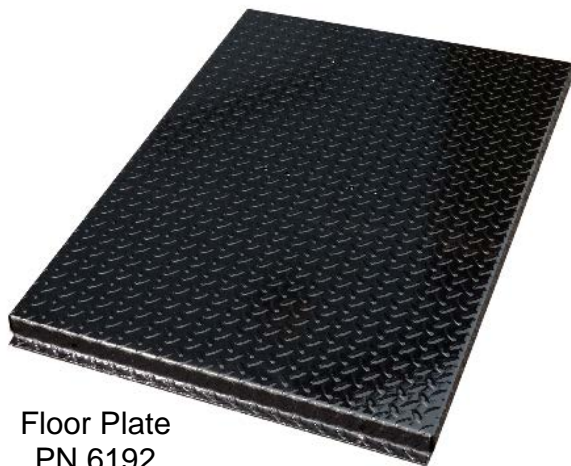
Floor Plate PN 6192