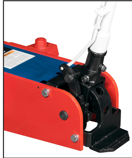
FASTJACK® mechanism raises the jack's lifting saddle to the load in one pump stroke.